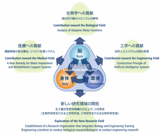
Fig. 2 Expected Impact of the Mobiligence Project