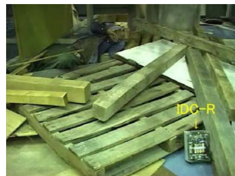
Fig. 4. Outlook of Victim Search Demonstration

On the other hand, in order to meet the specification that 1M[bit] of voice data shall be transmitted within one second