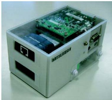
Fig. 6. Rescue Communicator

At normal times, the R-comm serves as a domestic broadband router using its internal wired LAN, wireless LAN, modem, and others. Besides, it may be used in watching elders or pet animals, monitoring any water leakage or short circuit, and performing overall control of domestic apparatuses on a daily basis. In our assumed senario, it may start to