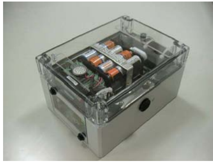
Fig. 3. IDC-R ver.2