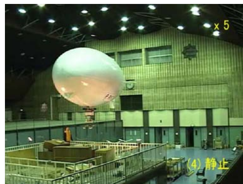
Fig. 2. Developed Victim Search System