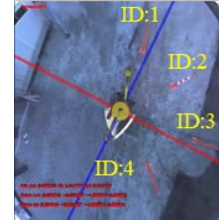
Fig.5 Pylons in the bird eye view