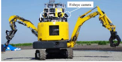
Fig.1 The disaster response robot

can move to an arbitrary position the viewpoint using trackballs or mice. The operator needs to monitor the robot itself for operating. Therefore, the robot CG model is arranged at center of the hemispherical 3D model. Moreover, the robot model arms and body's angle are synchronized with the real robot using angles sent from the robots. The system updates the scene every 30ms in average.