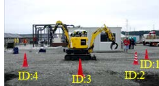
Fig.4 Around the robot