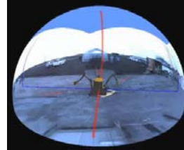
Fig.2 The Arbitrary Viewpoint Visualization